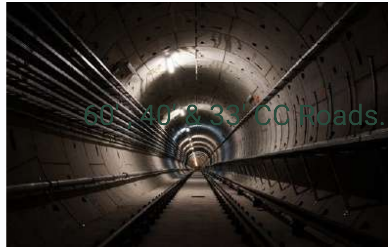
UNDERGROUND ELECTRICITY WITH STREETLIGHTS