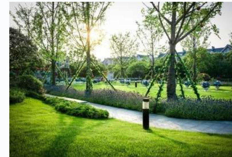
AVENUE PLANTATION WITH LANDSCAPING