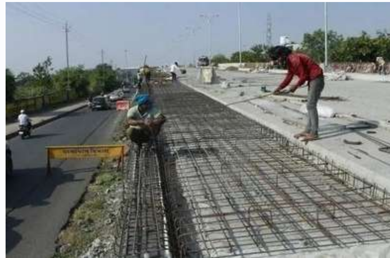
60, 40 & 33 FT WIDE CC ROADS