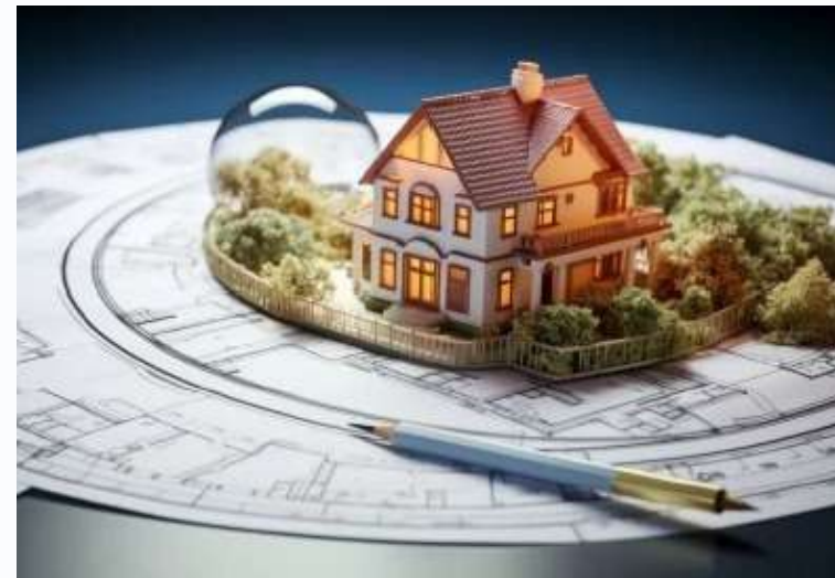
LAYOUT DESIGNED ON PRINCIPLES OF VASTU