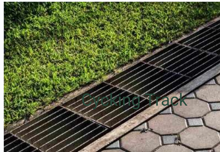
FULL-FLEDGED DRAINAGE SYSTEM